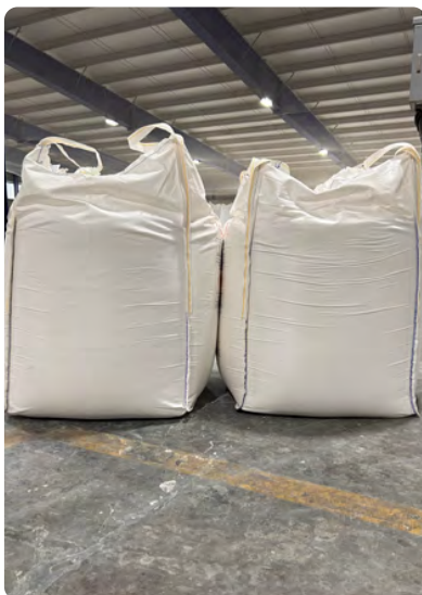
Container loaded with 1.25 tonne XL Big Bags

Almost 70% of the product soda ash is exported in bulk, also both products are exported in 25 kg small bags and 1.25 tonne big bags can be exported.