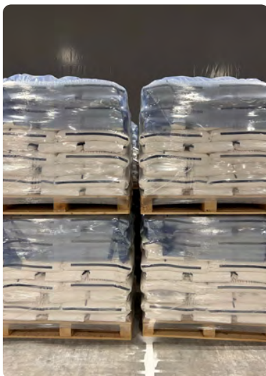
Palletised 25 kg small bags for container shipment