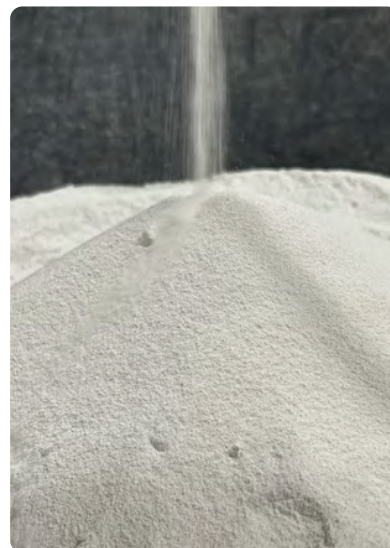
Products exported in bulk