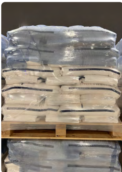
Palletised 25 kg small bags for container shipment