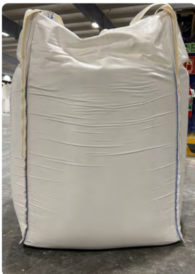
Container loaded with 1.25 tonne XL Big Bags

Almost 70% of the product soda ash is exported in bulk, also both products are exported in 25 kg small bags and 1.25 tonne big bags can be exported.